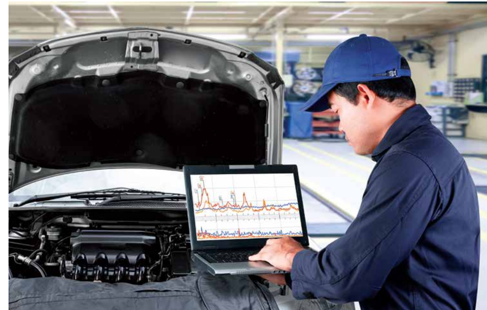
Automotive technologies are becoming more advanced

For anyone planning ahead for a career in automotive technology, students are advised to take courses in English, mathematics, computer technology, electronics, and auto and machine shop. To be successful, a high degree of mechanical ability as well as customer and personal service, engineering and technology knowledge, and critical thinking are necessary, as well as manual dexterity, auditory attention, and visualization.