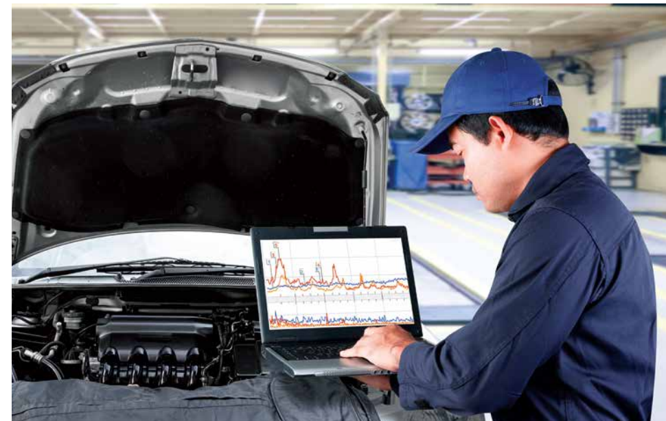
Automotive technologies are becoming more advanced

Reliable, Timely, Driver's License, Good Driving Record, Professional Clean Language, Honesty, Cell Phone Do's & Don'ts, Communication (Oral, Written, Body Language), Work Ethic, Interpersonal Skills, Responsibility "No Excuses", Team Work, Show Initiative, Don't Just Stand There!, Attitude, Job Search Skills, Eye Contact, Firm Handshake, Personal Presentation, Resume Writing