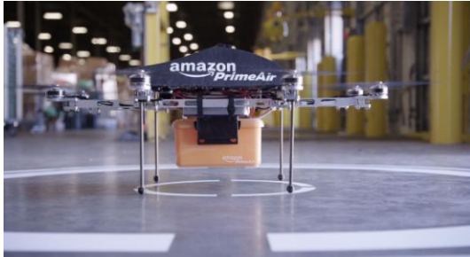
Figure 1- Prototype of PrimeAir UAV for Delivery Video at: http://www.amazon.com/b?node=8037720011

Amazon is “excited” about rapid home delivery using UAVs. “PrimeAir — a future delivery system from Amazon designed to safely get packages to customers in 30 minutes or less using small unmanned aerial vehicles” is what they are calling the proposed service. According to Amazon, “PrimeAir has great